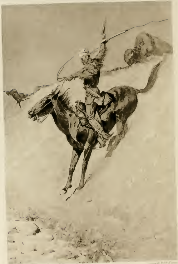
Illustration of a cowboy riding a bucking horse.